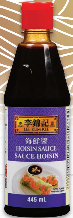
LEE KUM KEE HOISIN SAUCE 445 ML SAUCE HOISIN 20045048_EA