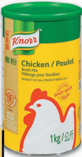
KNORR CHICKEN BOUILLON BROTH MIX 1 KG MÉLANGE POUR BOUILLON DE POULET 20154074_EA