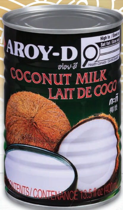
AROY-D COCONUT MILK SELECTED VARIETIES 400 ML LAIT DE COCO 20063864_EA