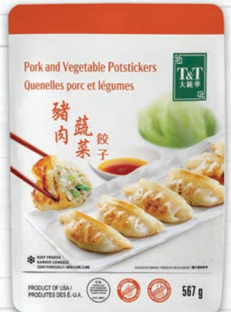
T&T® POTSTICKERS SELECTED VARIETIES, FROZEN, 567 G QUENELLES 21495823_EA