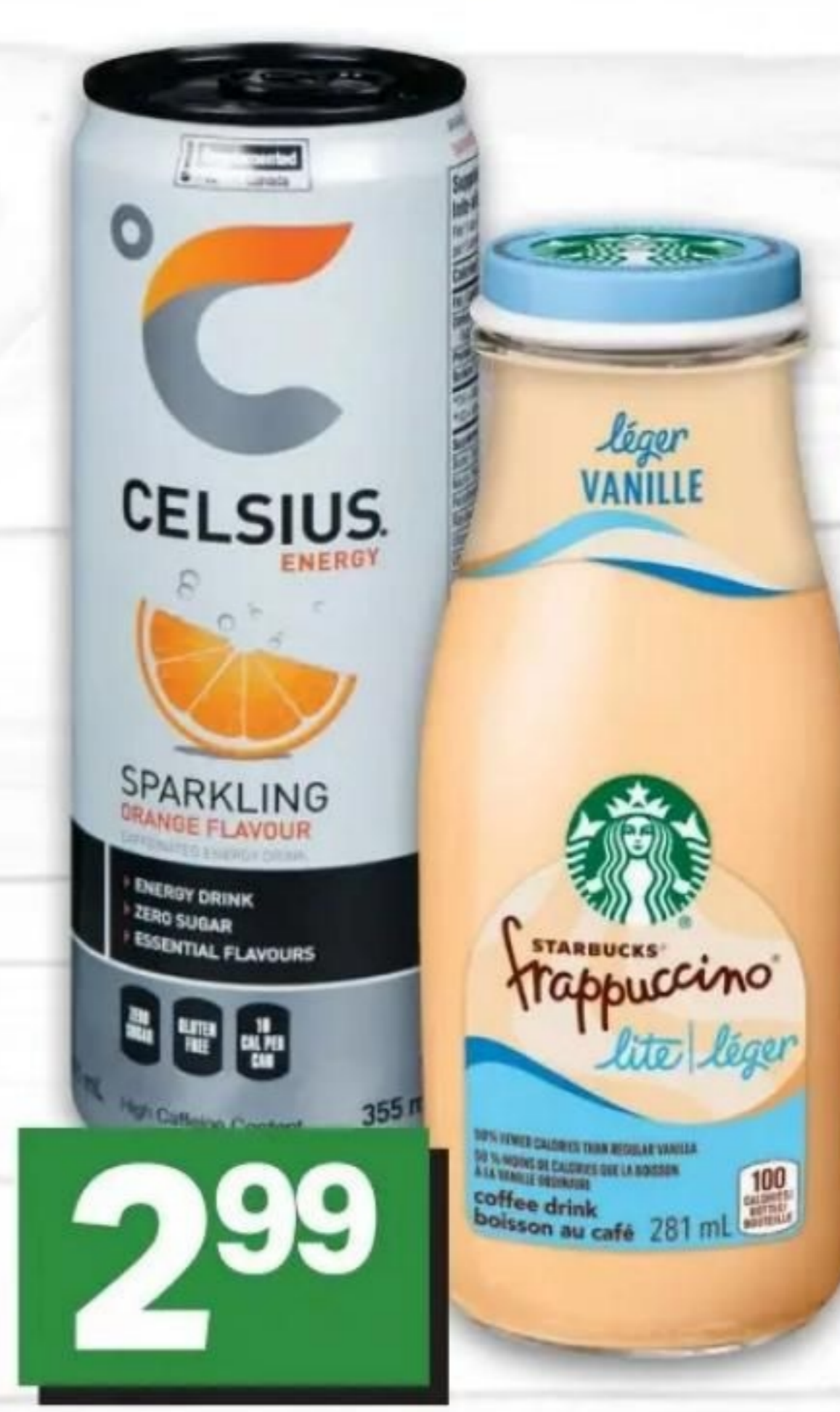
299 STARBUCKS DRINKS 405/444 ML OR CELSIUS 355 ML SELECTED VARIETIES BOISSONS 21576458_EA/21723923_EA