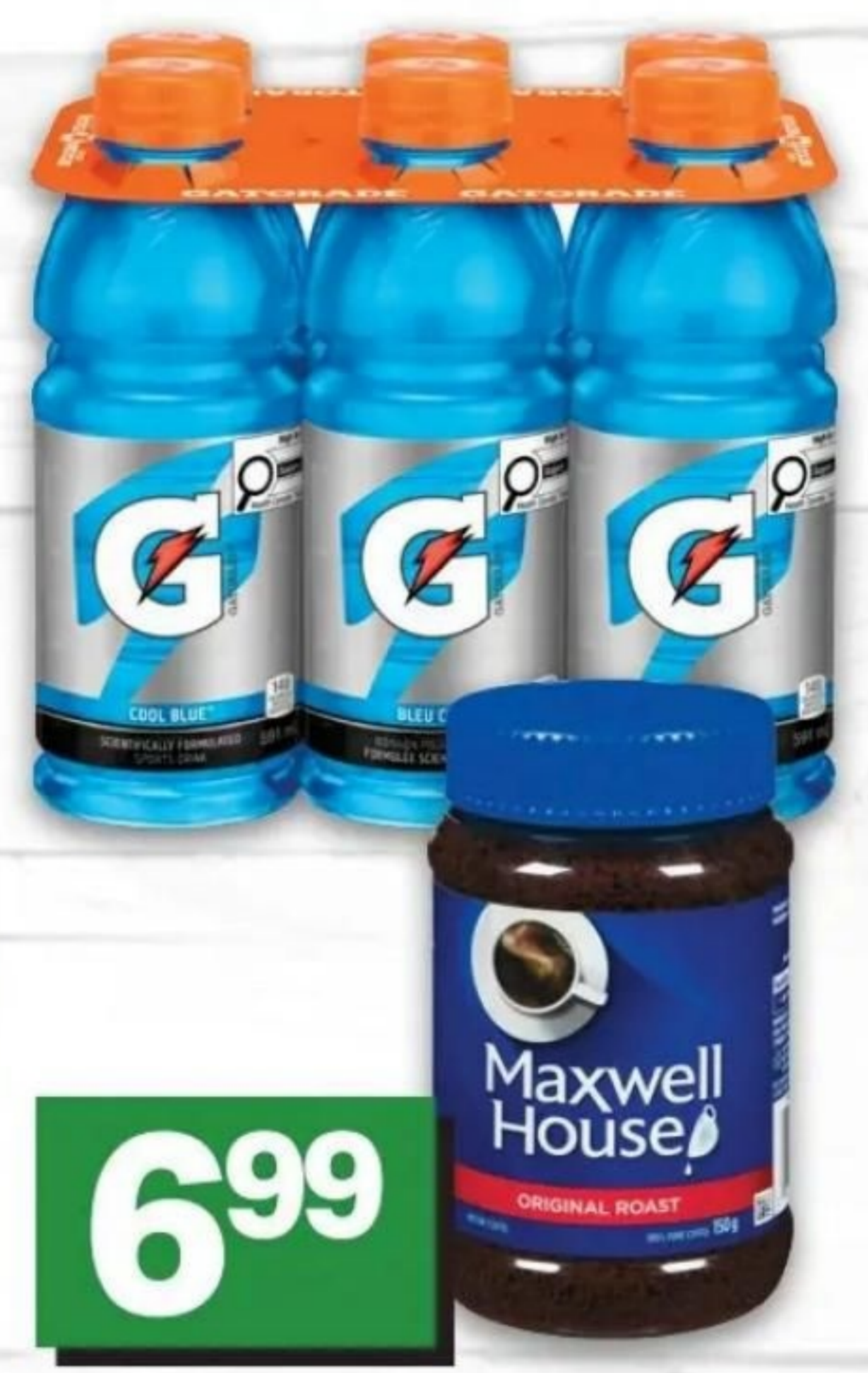
699 GATORADE SPORT DRINKS 6 X 591 ML OR MAXWELL HOUSE INSTANT COFFEE 150 G, SELECTED VARIETIES BOISSONS DÉSALTÉRANTES OU CAFÉ INSTANTANÉ 20303218003_C06/21026608_EA