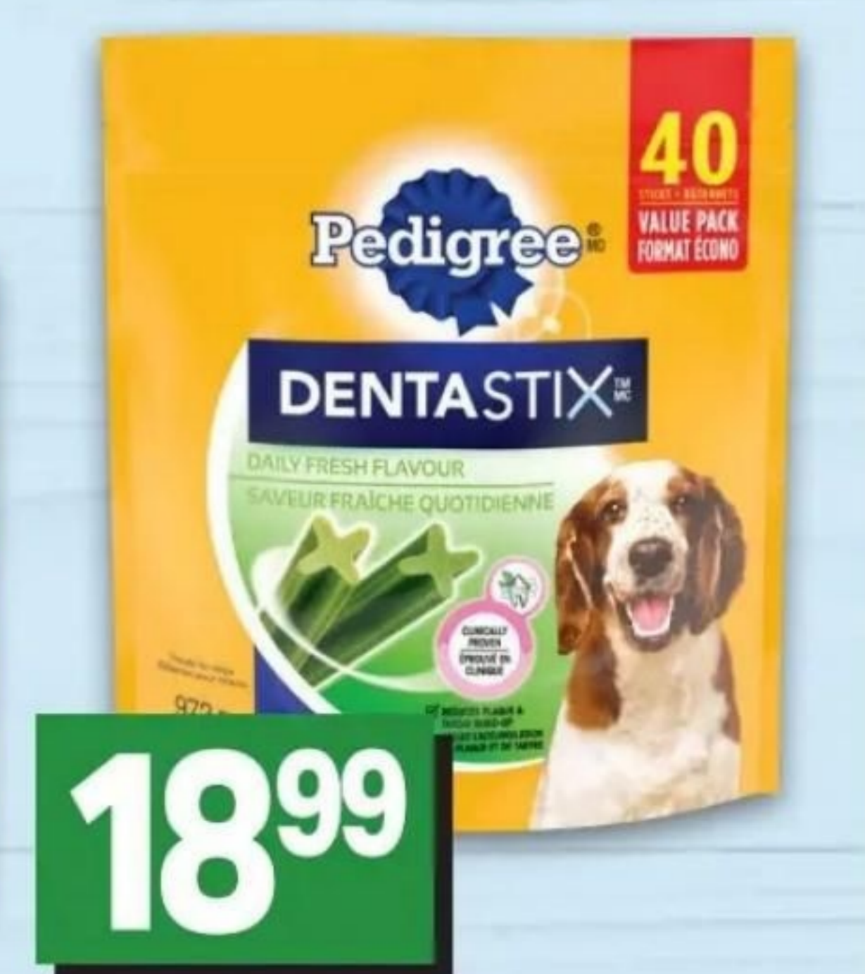
1899 PEDIGREE TREATS SELECTED VARIETIES 869-972 G GÂTERIES 21194056_EA