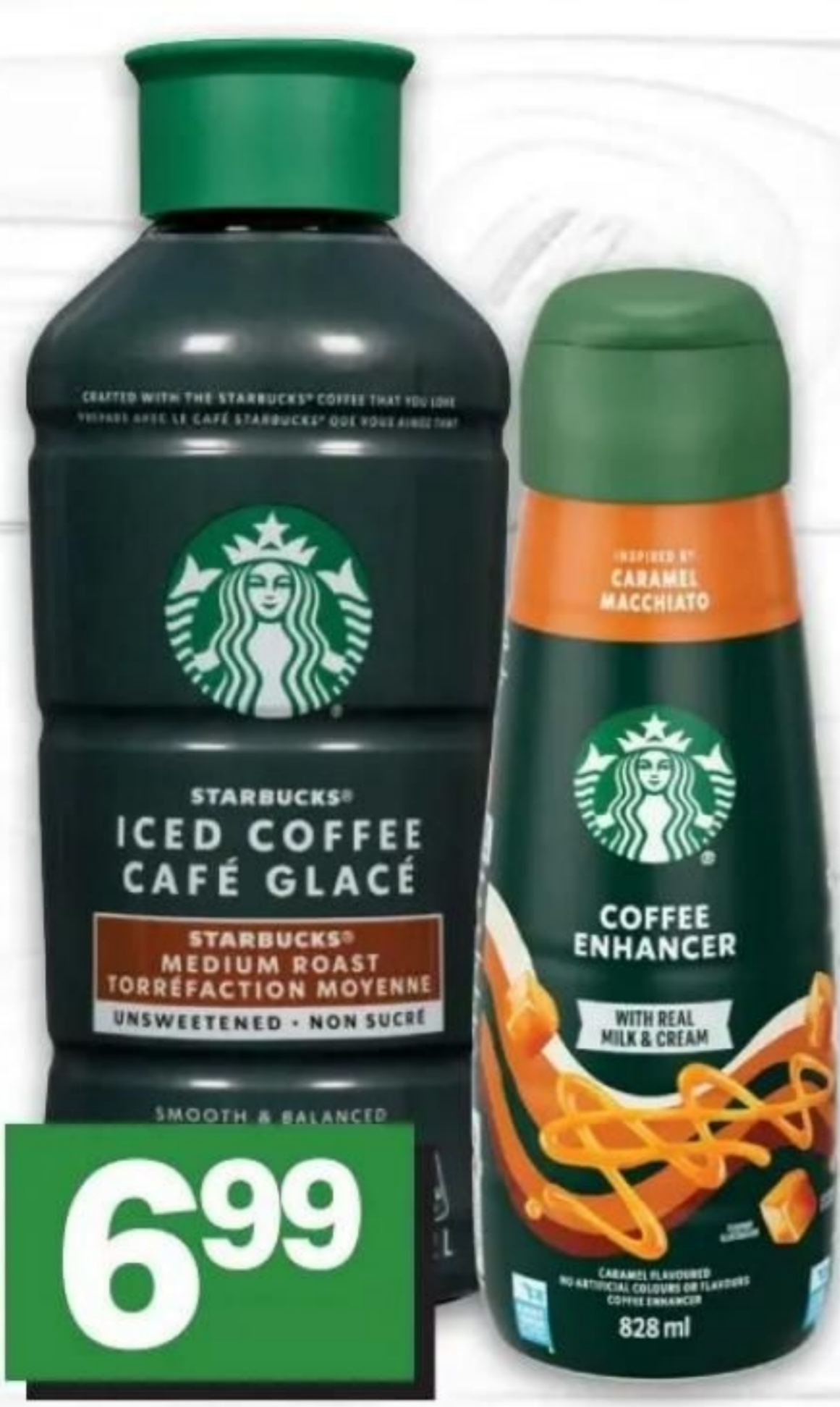
699 STOK OR STARBUCKS OR INTEL DELIGHT ICED COFFEE OR COFFEE ENHANCER SELECTED VARIETIES 828 ML/1.89 L-369/396 G CAFÉ GLACÉ OU REHAUSSEUR DE CAFÉ 21215527_EA/21358473_EA