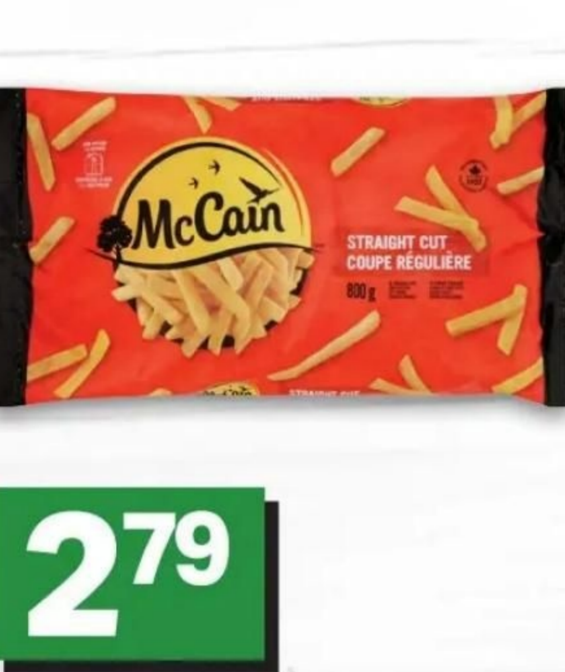
279 MCCAIN FRIES SELECTED VARIETIES, FROZEN 800 G FRITES 21521219_EA