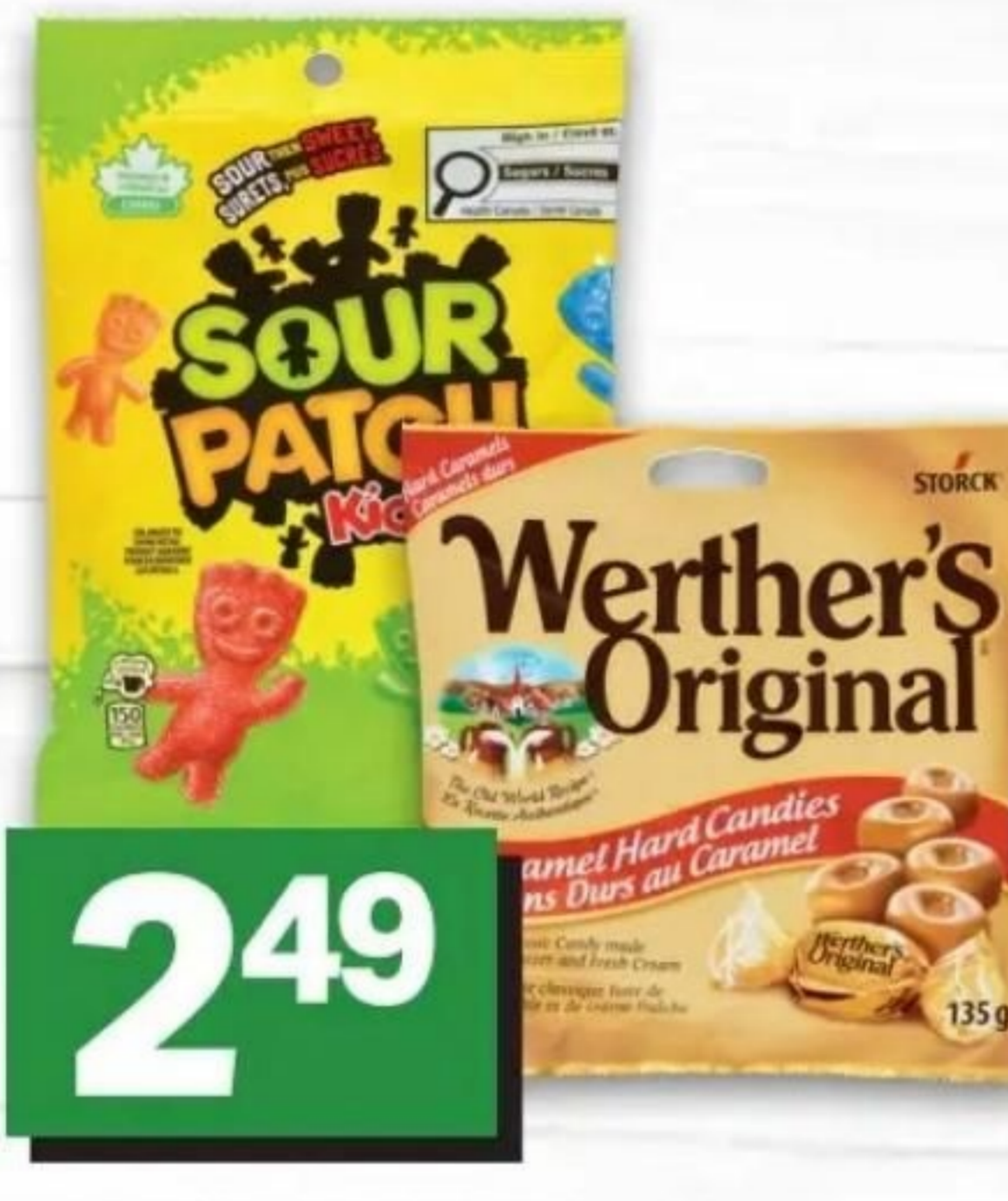
249 WERTHER'S ORIGINAL OR MAYNARDS SOUR PATCH KIDS GUMMIES OR CANDIES SELECTED VARIETIES, 60-154 G FRIANDISES 20898717_EA/21545554_EA