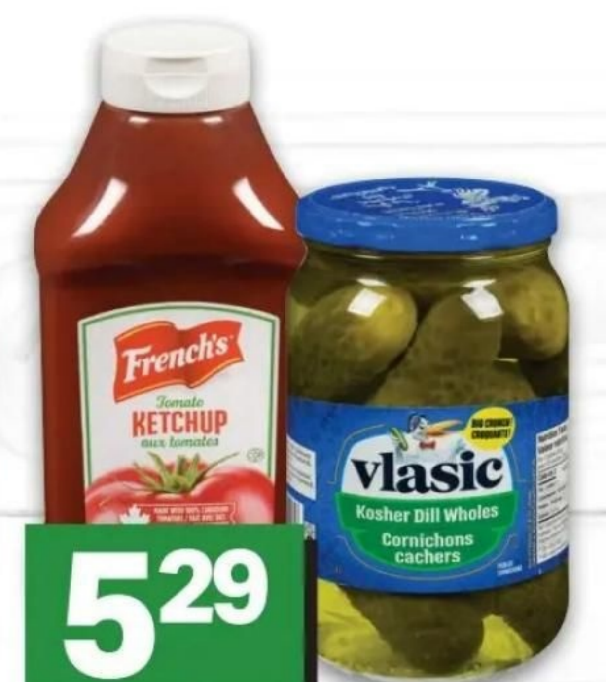
529 FRENCH'S KETCHUP 750 ML-1L OR VLASIC PICKLES 1L SELECTED VARIETIES KETCHUP OU CORNICHONS 20157347001_EA/20835951_EA