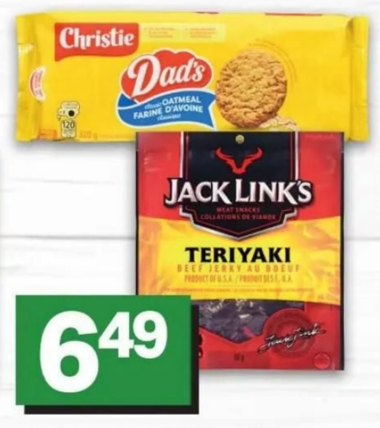
649 CHRISTIE DAD'S OATMEAL COOKIES 500/520 G OR JACK LINK'S MEAT SNACKS 65-81 G SELECTED VARIETIES BISCUITS OU COLLATIONS DE VIANDE 20501983004_EA/21014079_EA