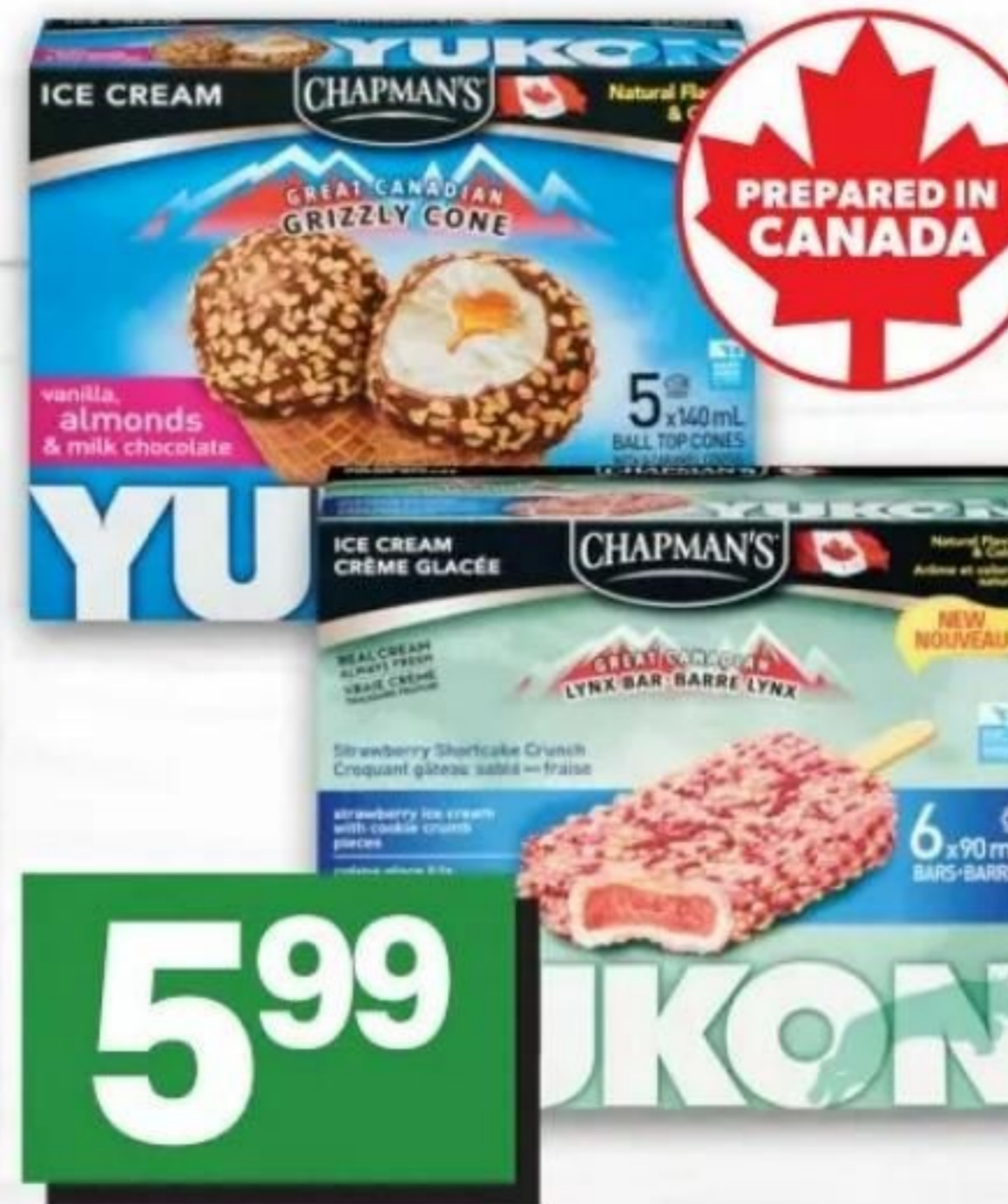
599 CHAPMAN'S YUKON NOVELTIES SELECTED VARIETIES, FROZEN 5-8'S FRIANDISES GLACÉES 21012281_EA/21583339_EA