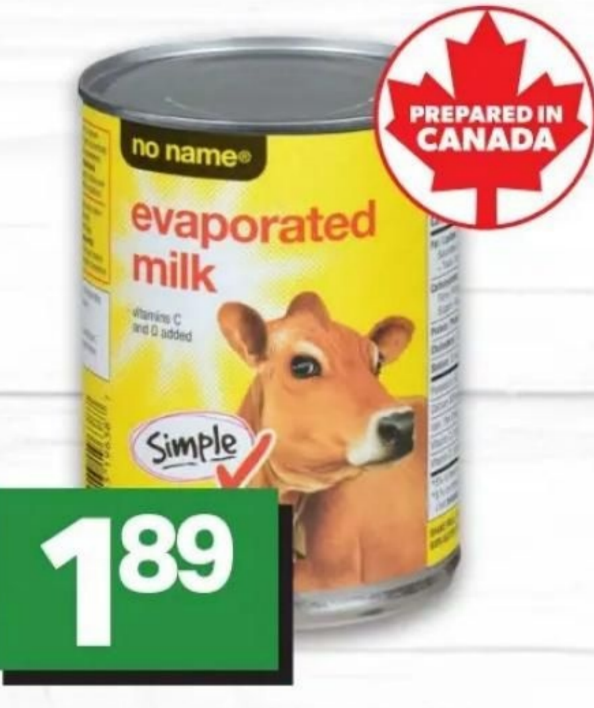
189 NO NAME® EVAPORATED MILK SELECTED VARIETIES 354 ML LAIT ÉVAPORÉ 21040510_EA