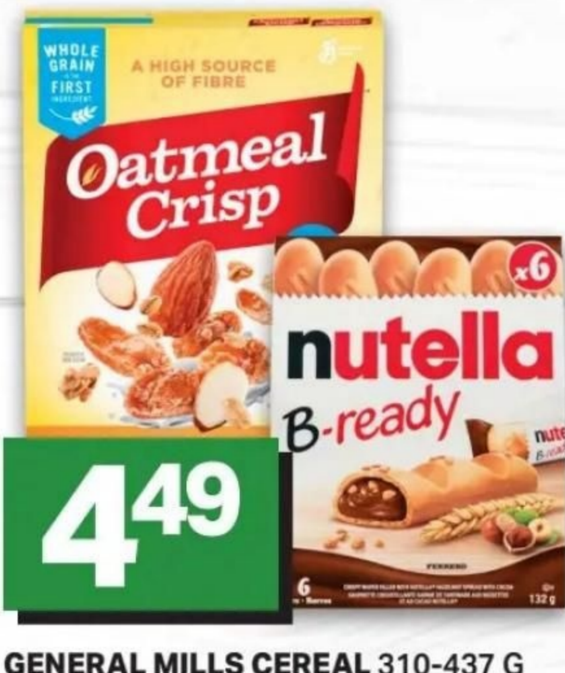
449 GENERAL MILLS CEREAL 310-437 G OR NUTELLA B-READY CRISPY WAFER WITH HAZELNUT SPREAD 132 G SELECTED VARIETIES CÉRÉALES OU GAUFRETTES AVEC TARTINADE DE NOISETTES 21213662_EA/21457401_EA