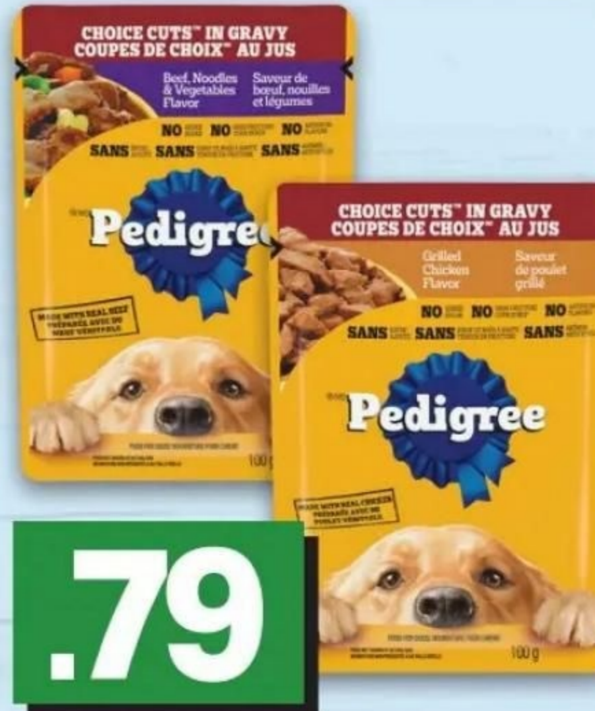
.79 PEDIGREE WET DOG FOOD POUCH SELECTED VARIETIES 100 G SACHET DE NOURRITURE POUR CHIENS 21659467_EA/21659566_EA