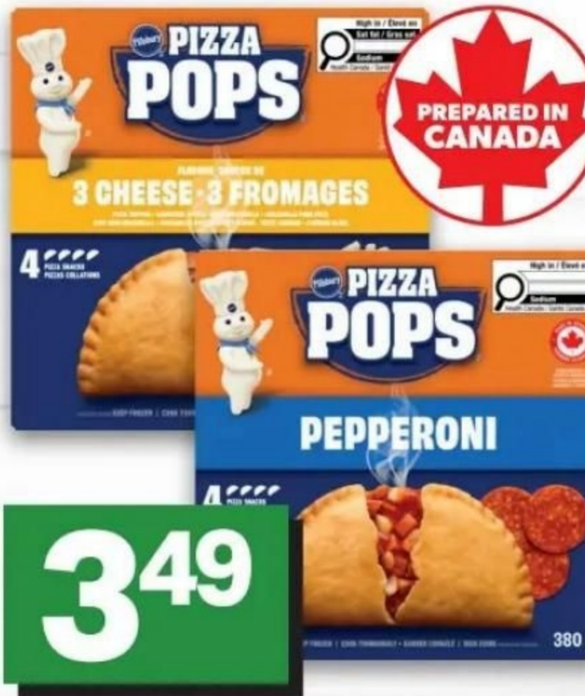
349 PILLSBURY PIZZA POPS SELECTED VARIETIES, FROZEN 4'S PIZZAS 21435996_EA/21436071_EA