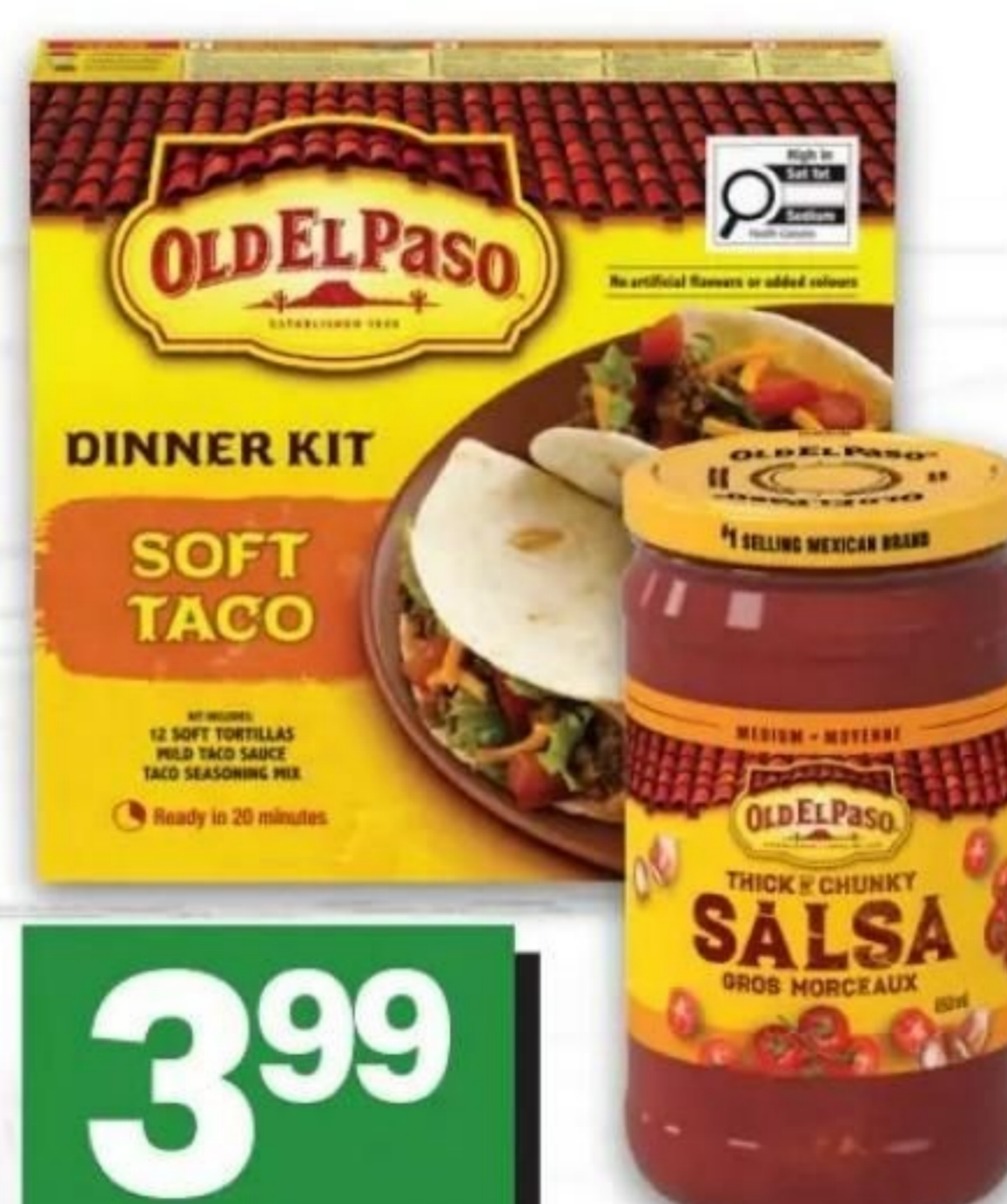
399 OLD EL PASO DINNER KITS SELECTED VARIETIES 250-510 G TROUSSES-REPAS 20305182001_EA/20795536_EA