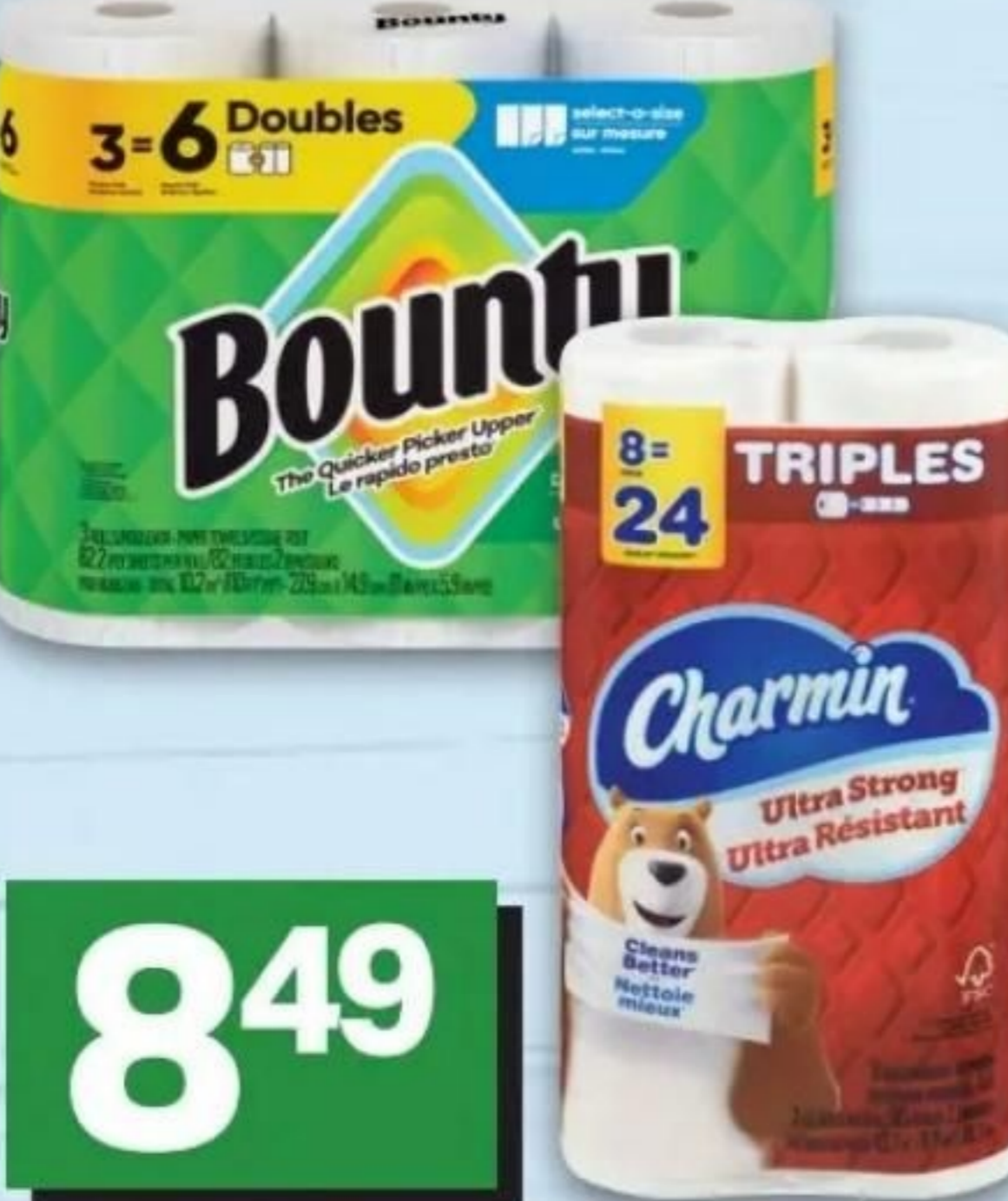
849 CHARMIN BATHROOM TISSUE 8=24 ROLLS OR BOUNTY PAPER TOWELS 3=6 ROLLS SELECTED VARIETIES PAPIER HYGIÉNIQUE OU ESSUIE-TOUT 21636615_EA/21670159_EA