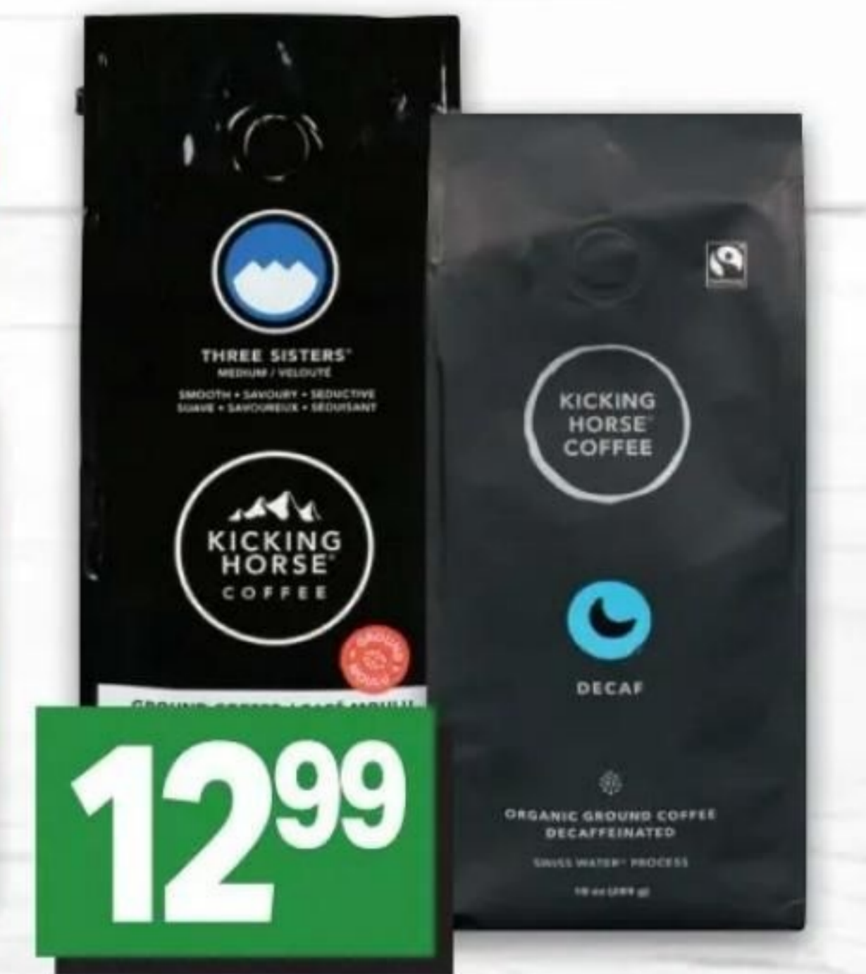
1299 KICKING HORSE GROUND COFFEE SELECTED VARIETIES 284 G CAFÉ MOULU 20805126001_EA/21517176_EA