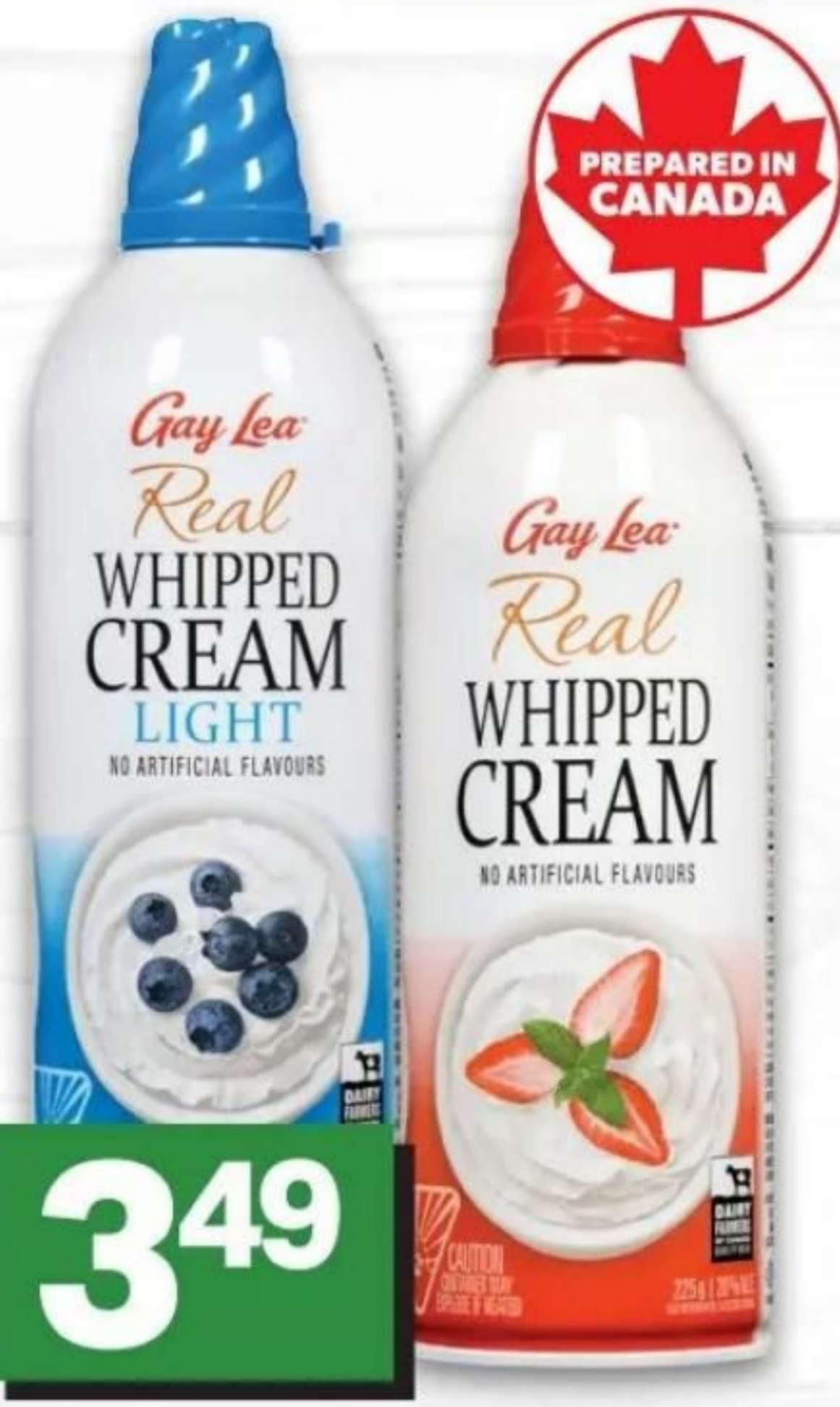
349 GAY LEA REAL WHIPPED CREAM SELECTED VARIETIES 225 G CRÈME FOUETTÉE 20048223001_EA/20048223002_EA