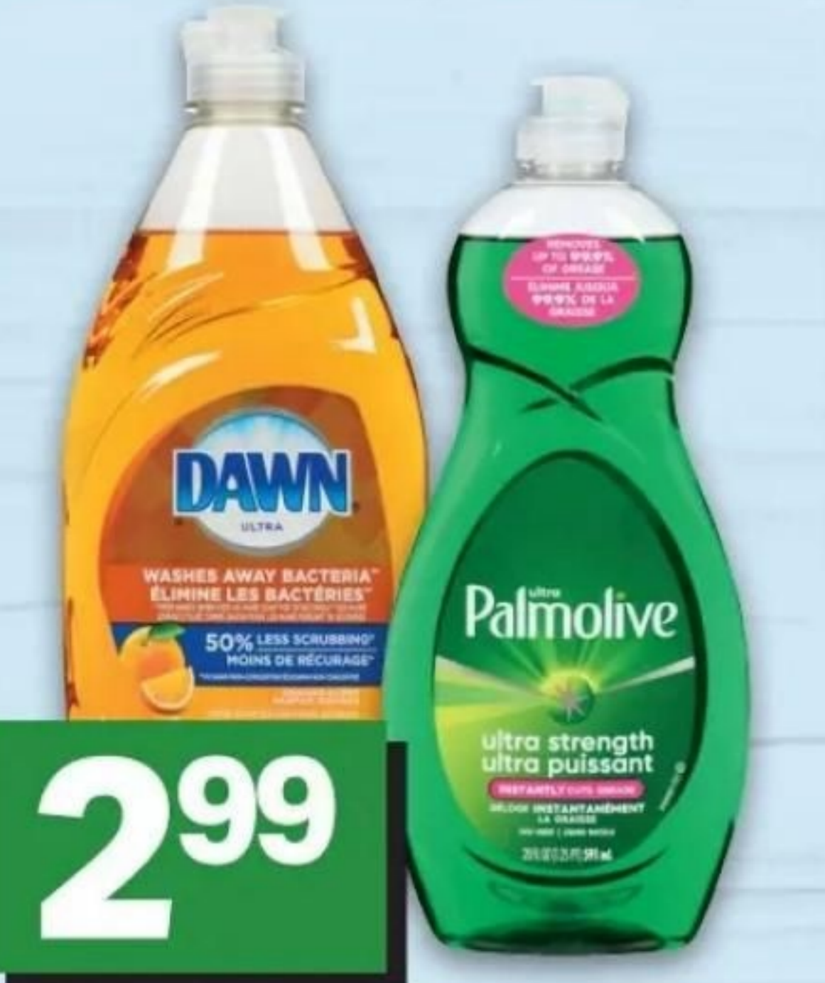
299 PALMOLIVE OR DAWN DISHWASHING LIQUID SELECTED VARIETIES, 431/828 ML DÉTERGENT LIQUIDE À VAISSELLE 21004368_EA/21430576_EA