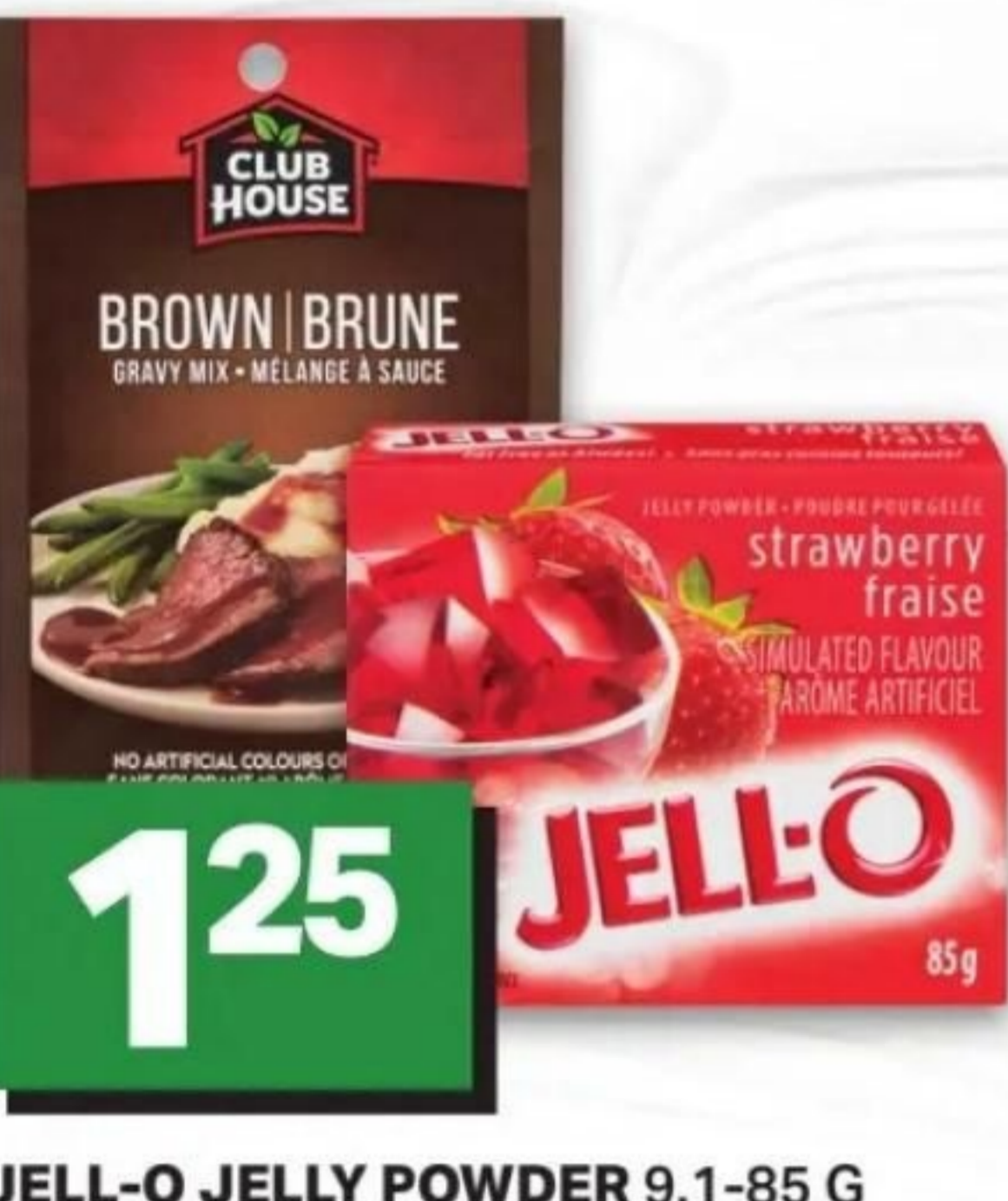
125 JELL-O JELLY POWDER 9.1-85 G OR CLUB HOUSE GRAVY AND SEASONING MIX 20-47 G SELECTED VARIETIES POUDRE POUR GELÉE OU MÉLANGE À SAUCE ET À ASSAISONNEMENT 20302816001_EA/20317293001_EA