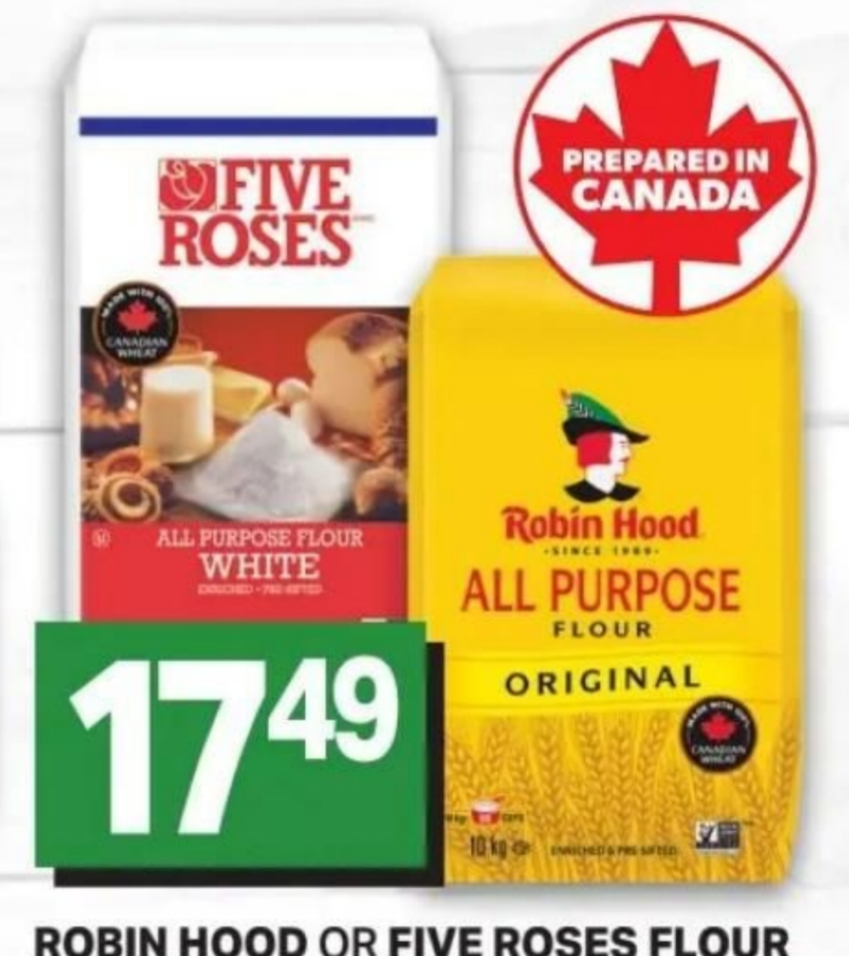
1749 ROBIN HOOD OR FIVE ROSES FLOUR SELECTED VARIETIES 10 KG FARINE 20134743_EA/20251651_EA