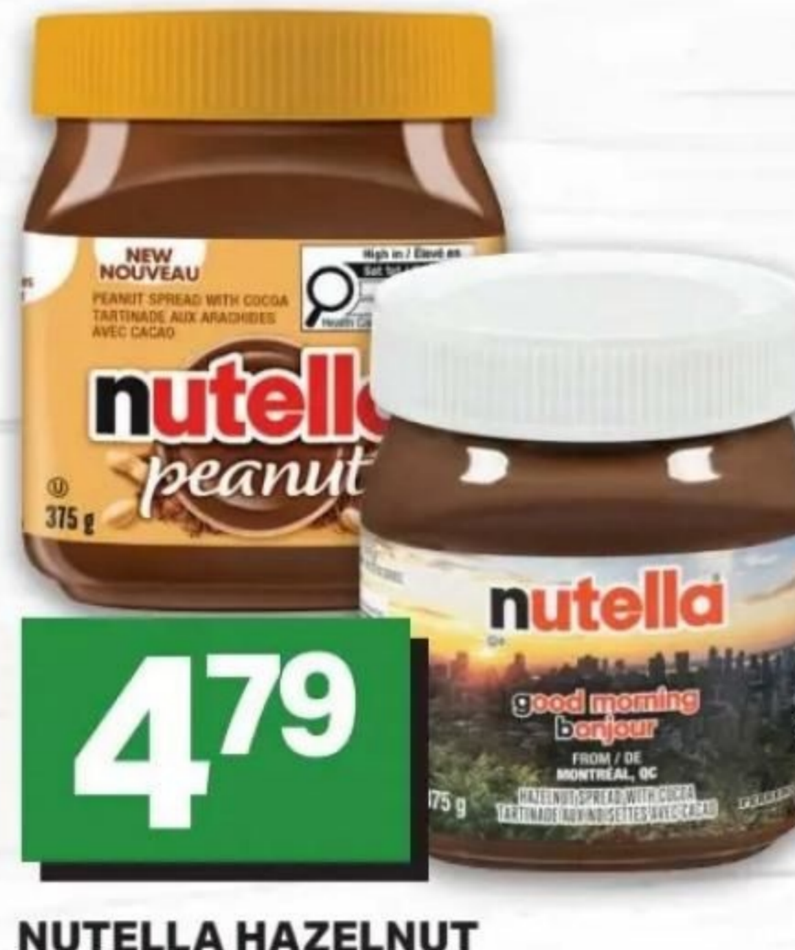
479 NUTELLA HAZELNUT OR PEANUT SPREAD 375 G TARTINADE DE NOISETTES OU ARACHIDES 21721261_EA/21457401_EA