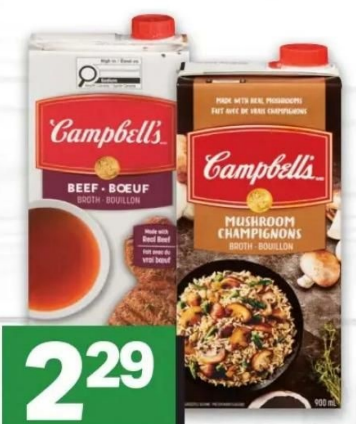
229 CAMPBELL'S BROTH SELECTED VARIETIES 900 ML BOUILLON 20322348003_EA/20981583_EA