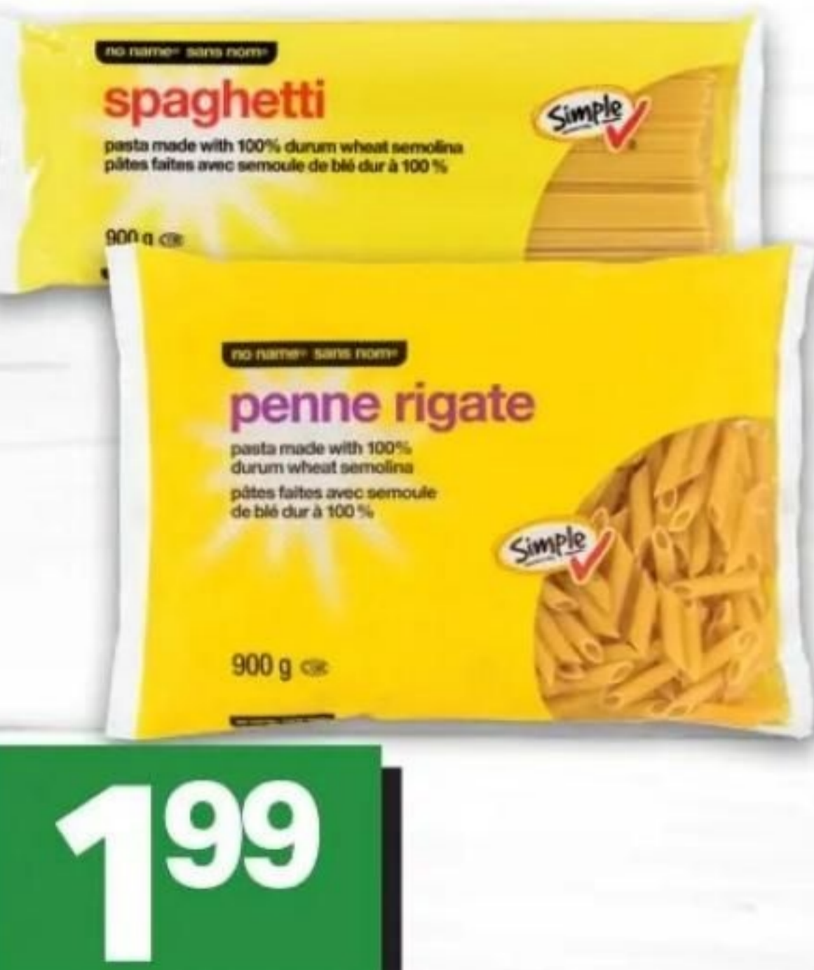
199 NO NAME® PASTA SELECTED VARIETIES 900 G PÂTES 20315613002_EA/20315613006_EA