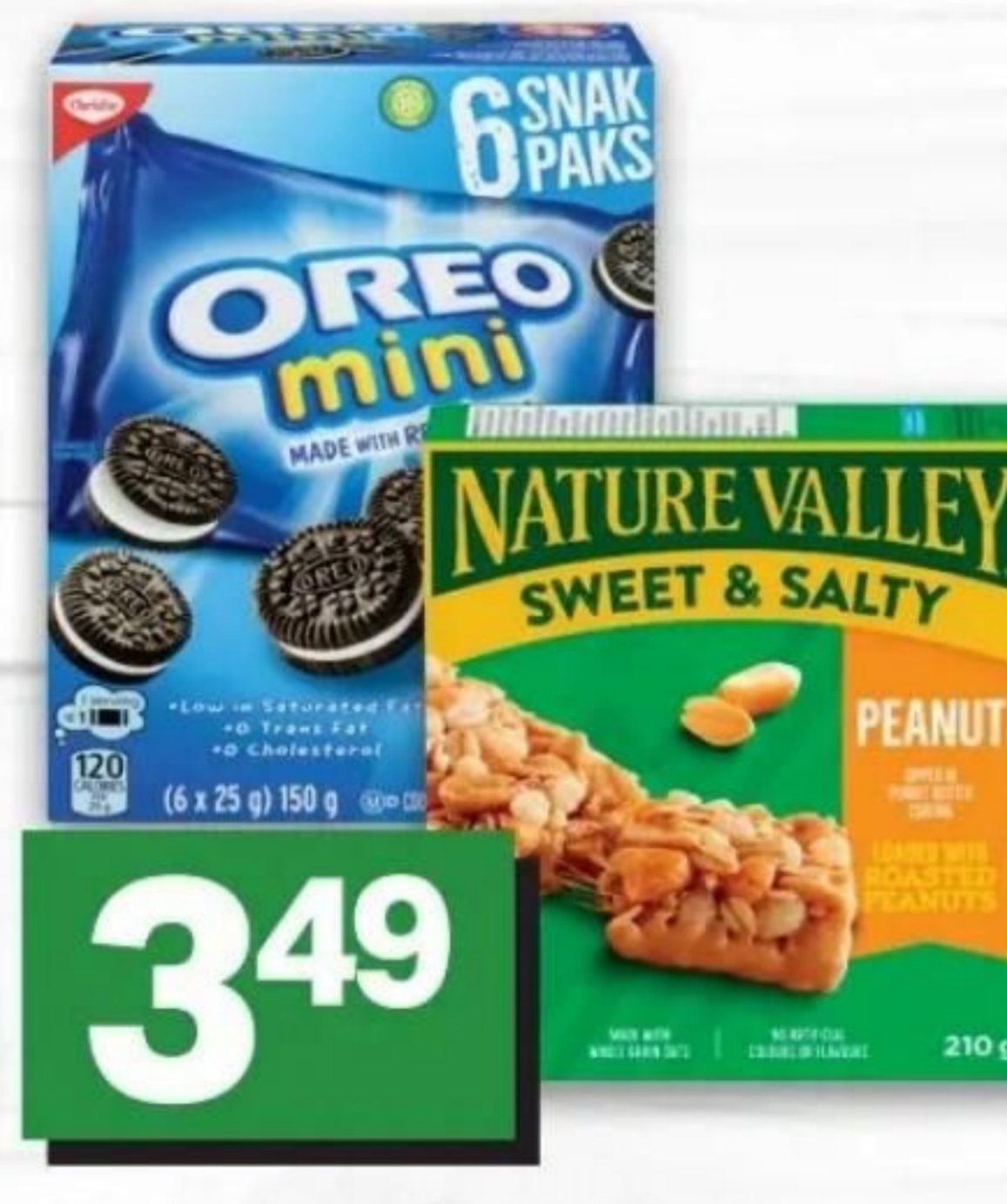
349 NATURE VALLEY OR FIBER1 BARS 125-210 G OR CHRISTIE MINI COOKIES 150-200 G SELECTED VARIETIES BARRES OU MINI-BISCUITS 21213585_EA/21584976_EA